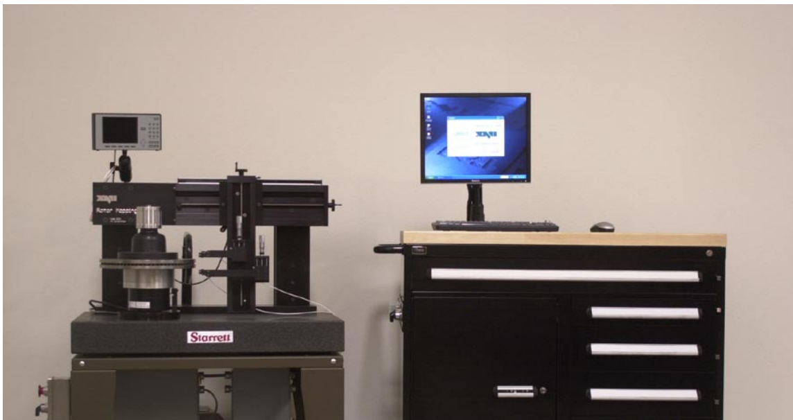
Model 2020-10 Table and On-vehicle Combination Unit